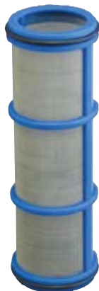
1" 80 Mesh